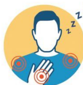
MUSCLE PAIN AND FATIGUE